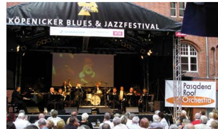
Concert sold-out: Happy those fans who were able to get hold of a ticket for the concert of the Pasadena Roof Orchestra at Berlin, Koepenick, during the 12th „Köpenicker Blues & Jazzfestival“.

For over thirty years the Pasadena Roof Orchestra, based in the UK, has delighted audiences all over the world with its mix of swing and hot dance music. Swing is much more than a musical genre, it personifies a lust for life, with its infectious beat. Its roots lie in the pre war dance bands, and the roaring twenties which inspired the later big swing bands. In contrast to many other musical genres swing has never really gone out of fashion over the decades, particularly in recent years. The Pasadena Roof Orchestra has played an important role in this resurgence of popularity.